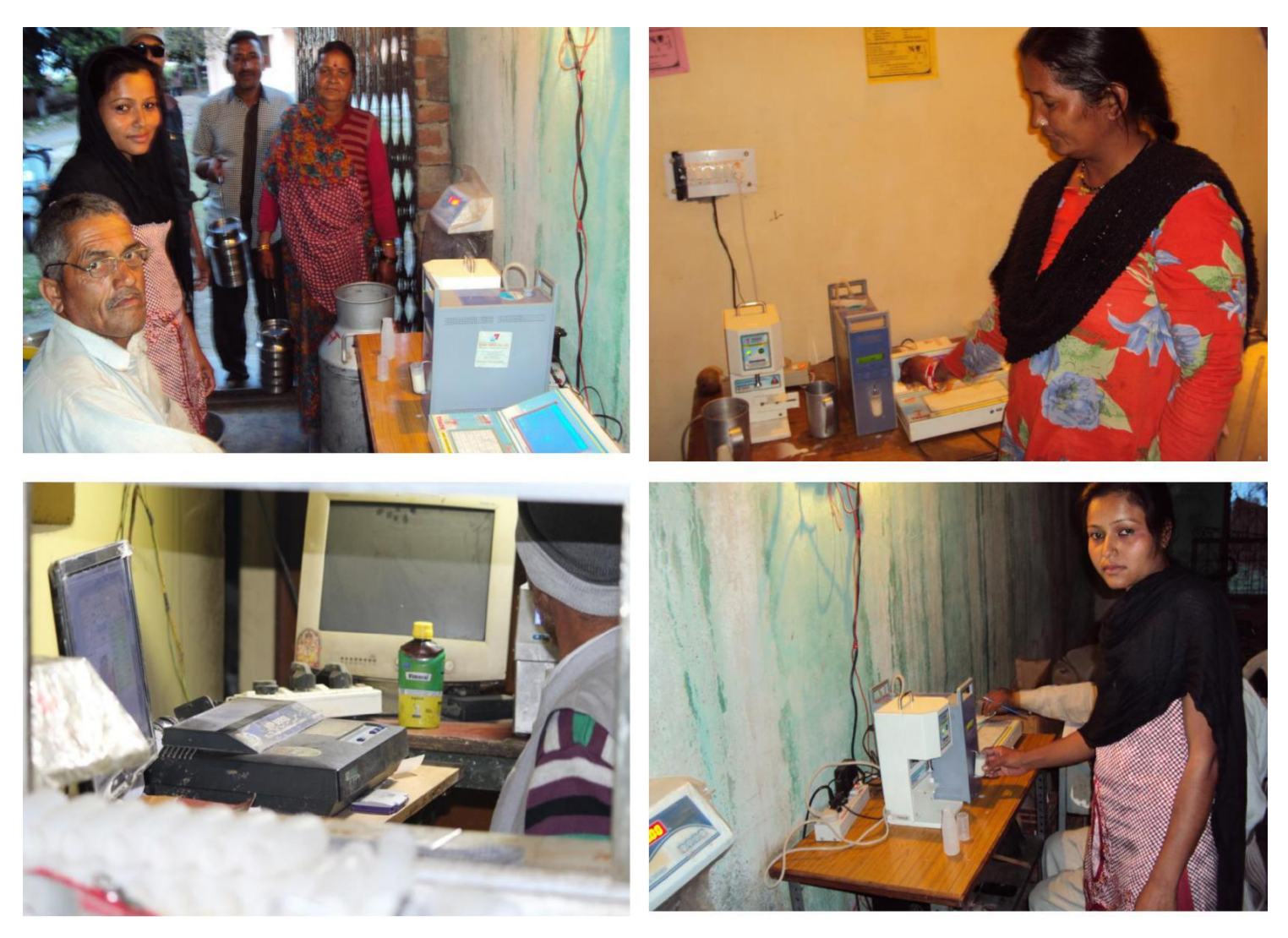
DPMCUs installation at different DCS that automatically detect milk Fat & SNF in milk and give result in few seconds and generate payment slip indicating Milk Quantity, Quality & Rate.

By this way, with aid from RKVY, UCDF was able to achieve objective of creating awareness among milk producer members on clean milk production by constructing milk rooms and strengthening dairy farmers by technological intervention through installing DPMCUs at DCS was successfully achieved. It has helped in strengthening farmers economically & socially as well. As a result of which, rural people are now taking keen interest in dairy farming and taking it as business & their primary source of income.