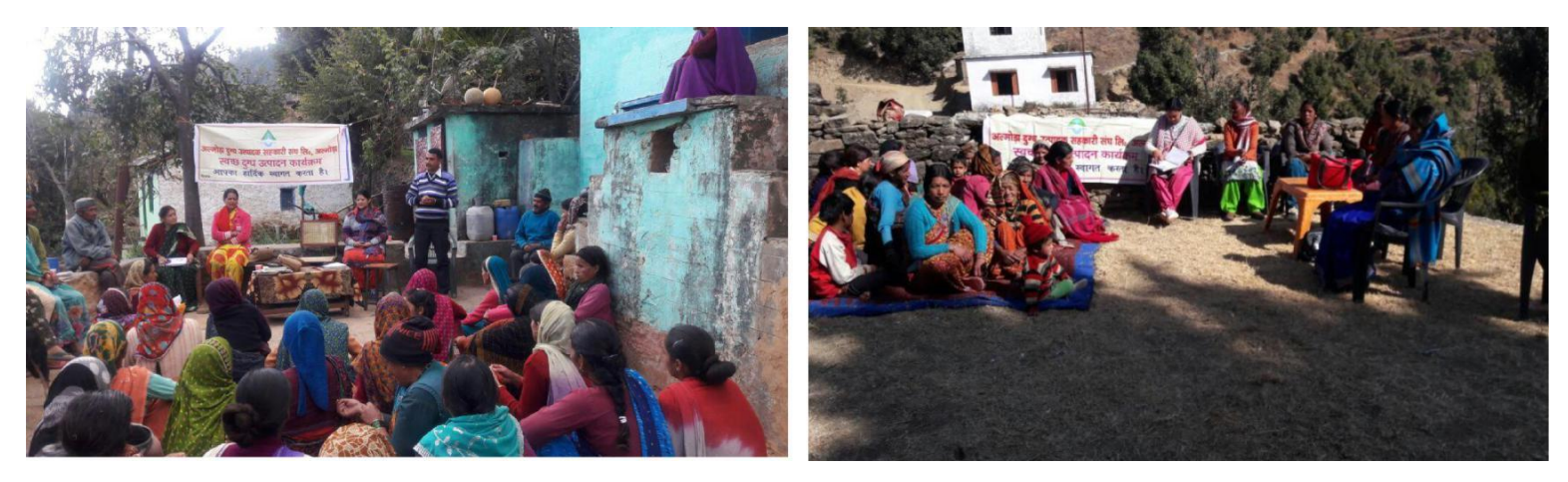
Launching awareness programme on Clean Milk Production among women dairy members